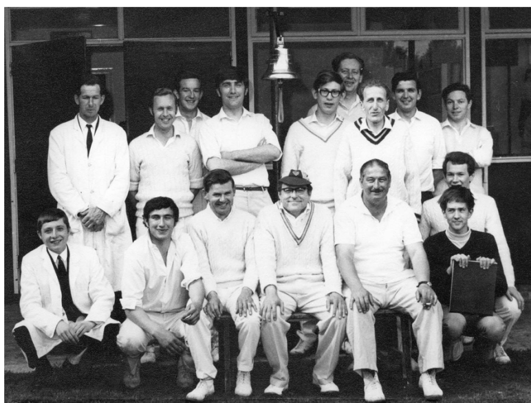
CHESHAM BOIS C. C. 1969