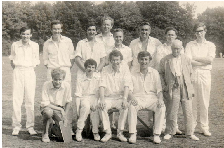
CHESHAM BOIS C. C. 1970

1970 Played 42 Won 21 Drawn 10 Lost 10 Tied 1