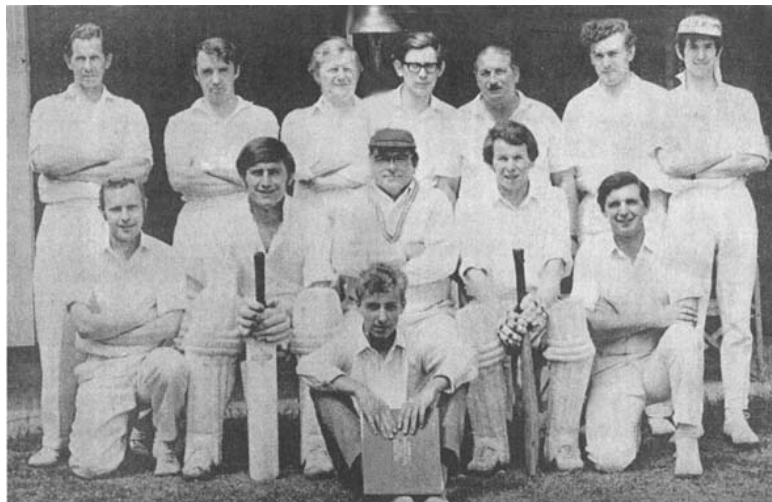
CHESHAM BOIS C. C. 1970