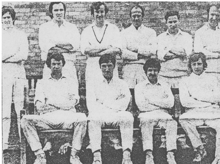
CHESHAM BOIS C. C. 1971