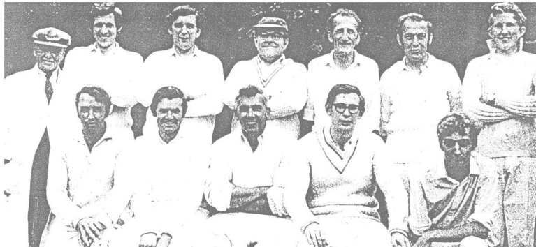
CHESHAM BOIS C. C. 1971

Saturday 24 th July v Great Missenden C.C. (As printed in the Bucks Advertiser Newspaper)