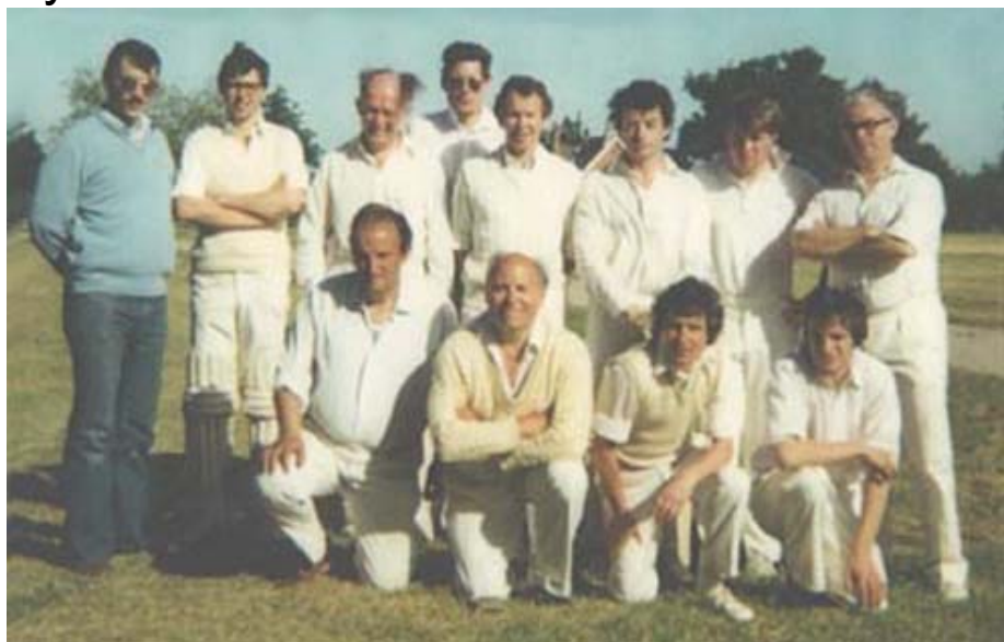
CHESHAM BOIS C. C. 1983 WILTSHIRE TOUR SQUAD. (Photograph taken Sunday 19 th June 1983 at Poulshot C.C.)