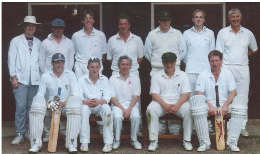
SUNDAY 1 ST ELEVEN 1996 Photograph Taken Sunday 15 th September Home v Old Gaytonians C.C.

1996 Played 58 Won 18 Drawn 21 Lost 18 Tied 1