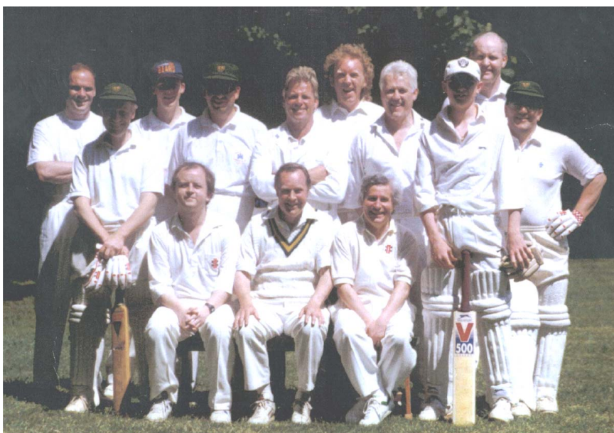
CHESHAM BOIS 2 nd XI SQUAD 1996