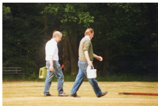
ALL IS READY FOR THE NEXT MATCH