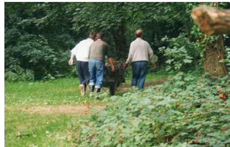
TO THE WOODS