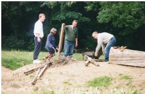
LOAD THE BARROW