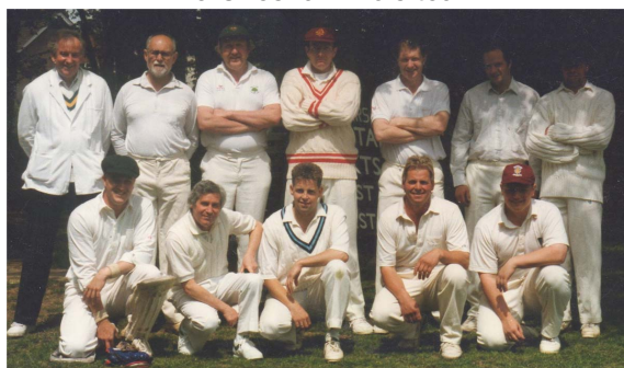
Back Row L-R