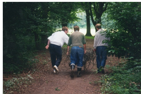
THE PACE IS GATHERING