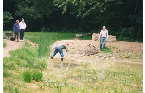
IN HE GOES