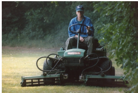
THE CONTRACTOR CUTS THE OUTFIELD