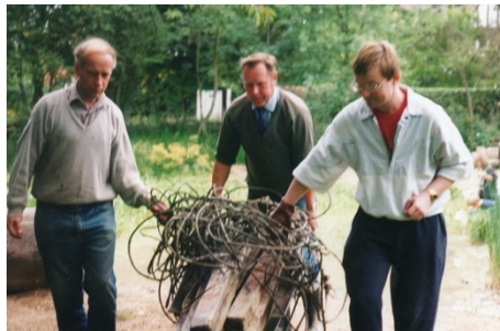
THE TEAM SET OFF