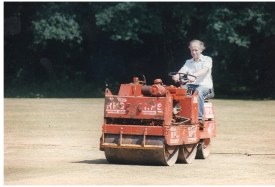
ALL TASKS WELL UNDERWAY