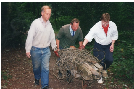
THE STRAIN SHOWS